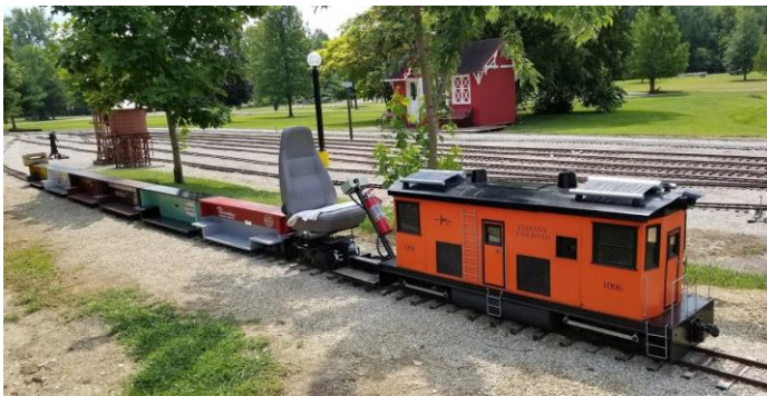
The train ride was great. –Ronnie Lawson