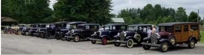
Three more cars came after picture was taken.

and trucks were there. We had two car games: ride the rail and bull's eye; three yard games: wet tee-shirt contest, toss the piston, and toss the Frisbee. Prizes were awarded for the best in each event. We had train rides which lasted about 25 minutes.