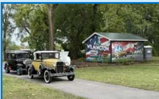
Approaching Wilmington, Illinois