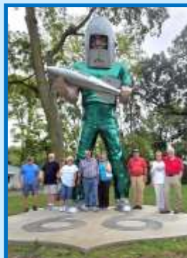
The Gemini Giant