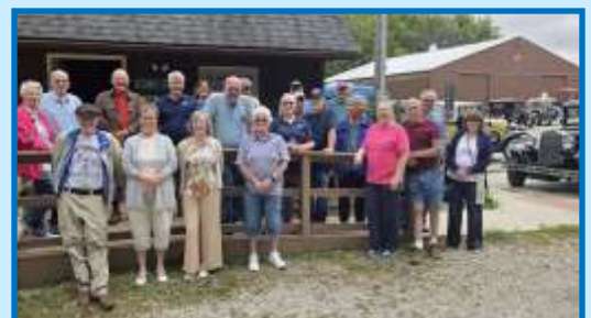
The Rt. 66 Travelers Assembled