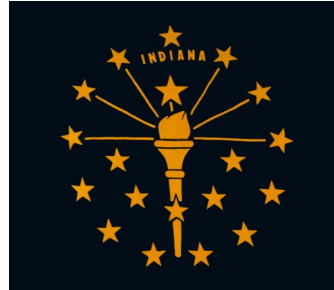
Indiana State Flag, 1917-1955